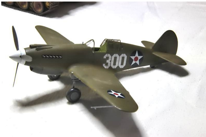
P-40

Take 95N to 495N. Take exit 14B (Rte 1 – North Attleboro). Go through the lights, heading towards North Attleboro on Rte 1. (Pass Boston Tropical Garden at lights) Go to next light, intersection of Rte 106 and Rte 1 – go right onto Rte 106 towards Plainville center. (Convenience Store at lights). go to bottom of hill at the light take a right onto Rte 1A. Go past the Plainville Police and Fire on your right. Take right onto Sharlene Lane – Willow Lane is the first right – I am on the corner of Willow Lane and Maple Terrace – #71 Look for my Honda in the driveway – I would like to ask everyone to please park along Sharlene Lane and walk down Willow Lane to my Condo – I am very close to Sharlene Lane. Thank you for parking there and making the short walk.