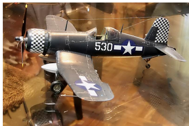
F4U-1D